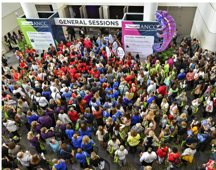
Registration exceeded all expectations, with 9,578 attendees from the U.S. and 26 other countries